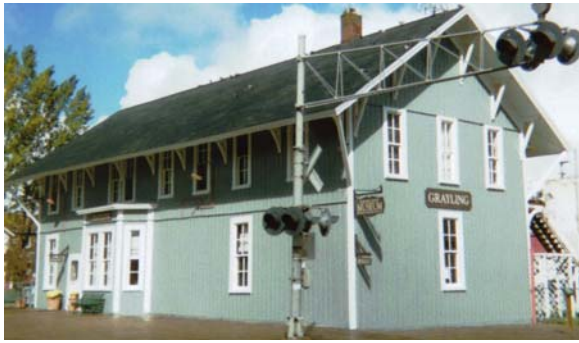
97 Michigan Avenue, Grayling, MI 49738